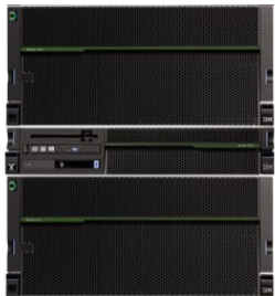
Serial Num 12345