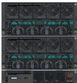
Serial Num 12345